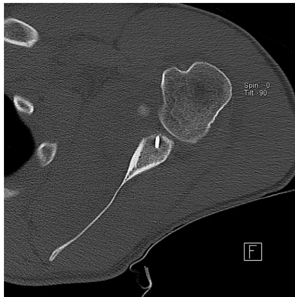
FIGURE 2. Axial computed tomography scan of inferior anchor. The glenoid rim was observed to have fractured distal to a well-fixed anchor.

would predispose the edge of the glenoid to fracture if enough stress is applied. Figures 1-3 show images from a patient with metallic anchors who sustained a glenoid rim fracture after a